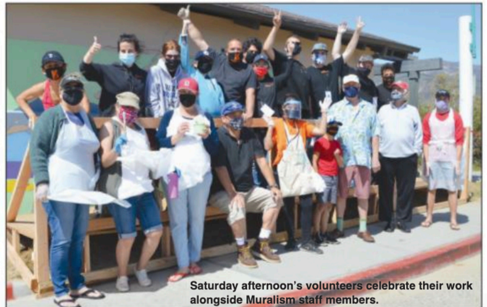
Saturday afternoon's volunteers celebrate their work alongside Muralism staff members.